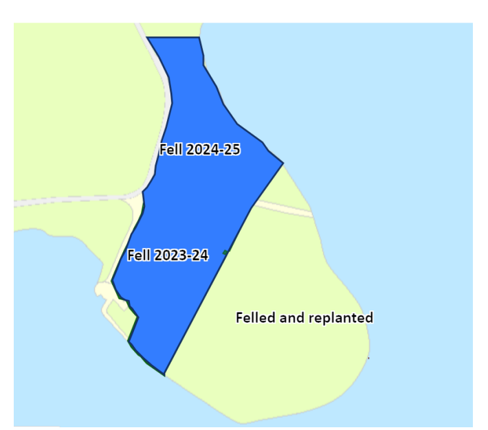
Figure 4. Map showing proposed felling of conifer block.

Version 1 suggested that replanting should be undertaken using a mix of native species, rather than commercial conifers, to provide screening for the Osprey nest and enhance biodiversity value. As of March 2023, all areas that have so far been felled have been replanted with native species, including oak and birch.