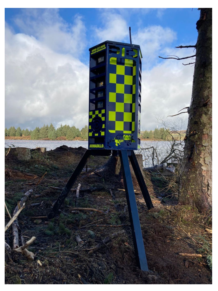
Figure 3. One of two intrusion detection cameras installed near the nest.