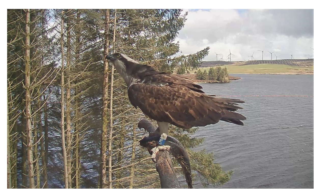
Figure 5. LM6 feeding on a freshly-caught Rainbow Trout

Any disturbance events observed from the Osprey Lookout should be recorded. Particular attention should be paid to instances of disturbance during incubation or when there are small dependent young in the nest, which can have the most significant effects on the outcome of the breeding attempt. During this stage it is rare for breeding Ospreys to leave the nest unattended. Any occasions when this occurs should be carefully recorded, including the total time the adults were off the nest. Efforts should also be made to identify the source of