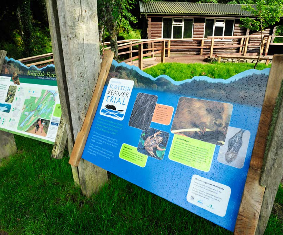
Scottish Beaver Trial

the Trial increasing visitor numbers to the area. The value of wildlife experiences at Knapdale itself, such as guided walks were calculated between £355,000 and £520,00 over the five-year trial period (Gaywood et al. 2015). In addition, huge numbers of adults and children engaged with the project throughout the 5-year trial through formal and