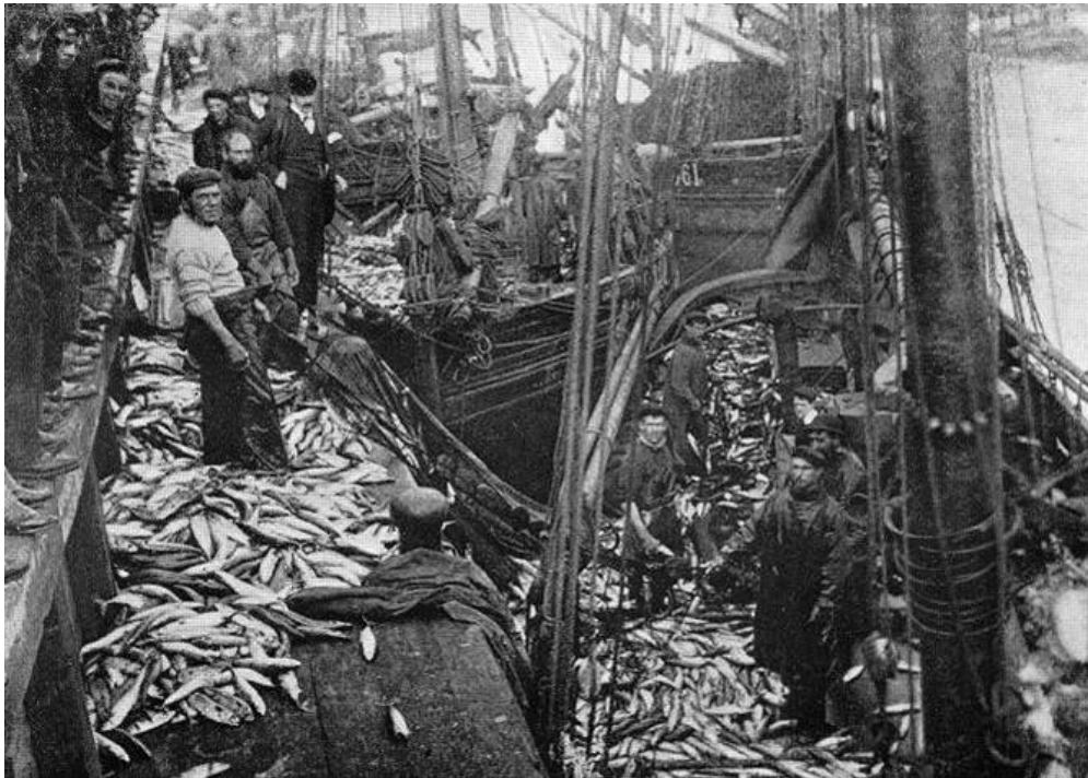
Once abundant fish stocks

Is there a future for our fish & fishermen?